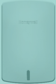
Wireless Wall Mount Humidity/Temperature Sensor